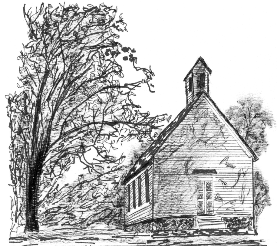
ARTIST'S CONCEPT ASSOCIATE REFORMED PRESBYTERIAN CHURCH AT PISGAH POTTSVILLE, ARKANSAS C. 1853